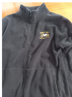
Polo Fleece $35