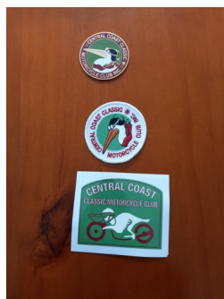
Cloth Patches $5 Metal Badge $25