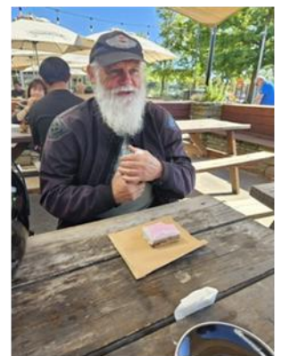
A couple of "Lord of The Rings" extras