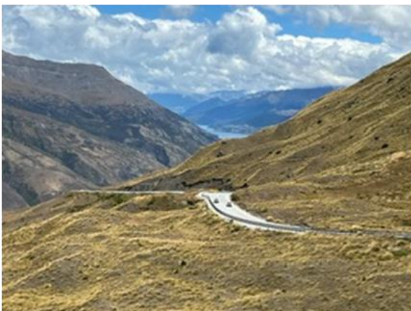
Crown Range magic