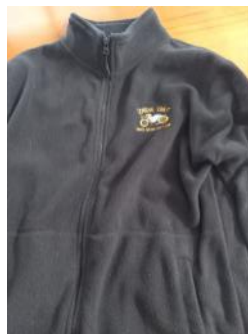
Polo Fleece $45