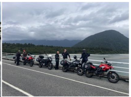
Breather on the Bridge

We awoke in Haast to the expected wet weather. We headed East back over the alps over the Hasst Pass stopping at a café at Makarora for a bite where we were entertained by group of Harley riders in gumboots (must be a kiwi thing) also making the pilgrimage to the Bert. Wheelies and burnouts were the order of the morning.