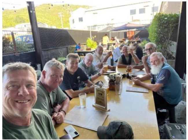
Dinner at Monteith Brewery

Then it was down the West Coast to Haast, a great coastal ride with wild volcanic beaches, rain forest wilderness and glaciers. We were very lucky to have scored a dry day as this part of NZ rains over 300 days / year.