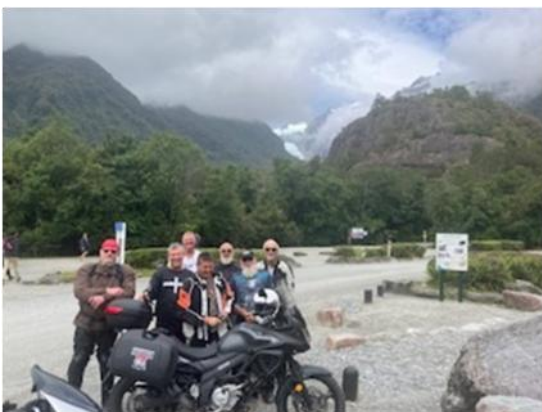
West Coast wilderness

Then it was down the West Coast to Haast, a great coastal ride with wild volcanic beaches, rain forest wilderness and glaciers. We were very lucky to have scored a dry day as this part of NZ rains over 300 days / year.