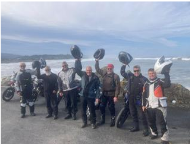
Good spirits on the Greymouth break wall