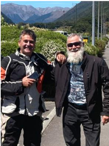
Hobbits in arms ☺