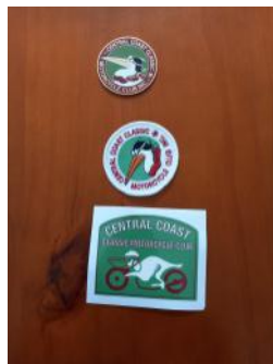
Cloth Patches $5 Metal Badge $25