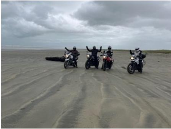
Famous Oreti Beach Invercargill